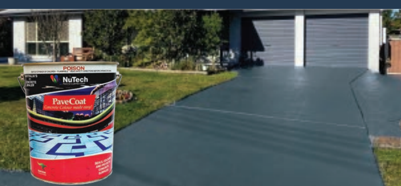
*For a full list of our Concrete Coating Range see our Concrete Coatings product range brochure. *Image Concrete Colour: Bluestone.

NuTech has a comprehensive coatings range to provide durable, decorative and protective solutions and finishes for any concrete surface requirement.